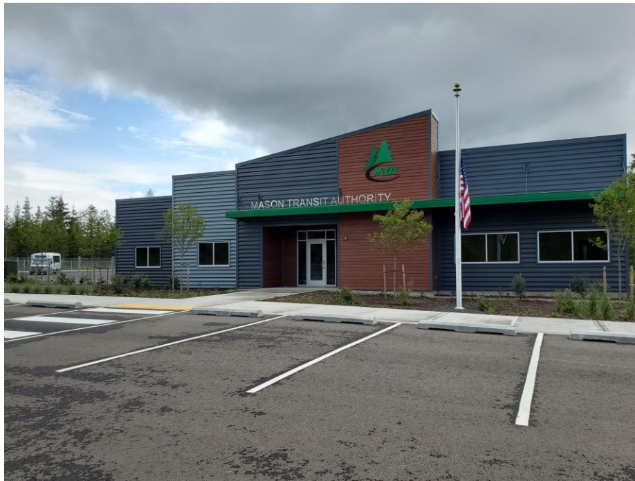
MTA's Belfair Park and Ride, 2022.