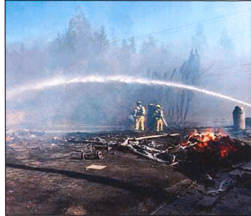
Crews fight a garage and house fire April 15 near state Route 106 in Belfair.

State Department of Natural Resource crews worked through the night, using a water-dropping helicopter to douse hot spots.