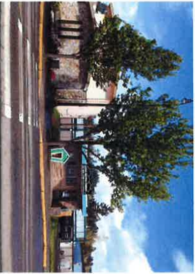
Looking Towards Existing Transit Community Center from Railroad Avenue

The new Transit Community Center is celebrated in the Vision Plan with connections to north and south adjacent parcels. A new raised table crosswalk across Franklin Street to Sawley allows for safer crossing at this busy bus street. And the alley behind the Shelton Inn is shown as an improved alley, better connecting the Transit Center to Railroad Avenue. The current building pictured below (previously an optometrist's office and currently owned by the Transit Center) is envisioned as demolished and its lot converted into a flexible grasscrete parking lot that could accommodate evening movies or other flexible uses such as the farmers market. Grasscrete is a cast-in-place concrete product that has a pattern of voids filled with stone or grassed soil that allows water to pass through the concrete. It creates a sustainable park-like quality while also supporting cars. The final design should incorporate low-impact stormwater features, pedestrian amenities as well as the necessary utility and service elements, such as enclosures for trash and recycling containers, within the improved alley.