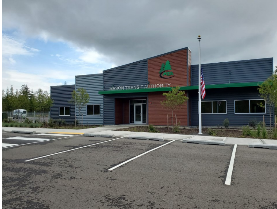
MTA's Belfair Park and Ride, 2022.